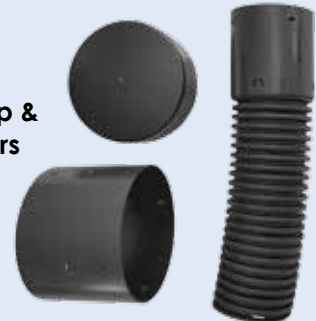
End Cap & Adaptors